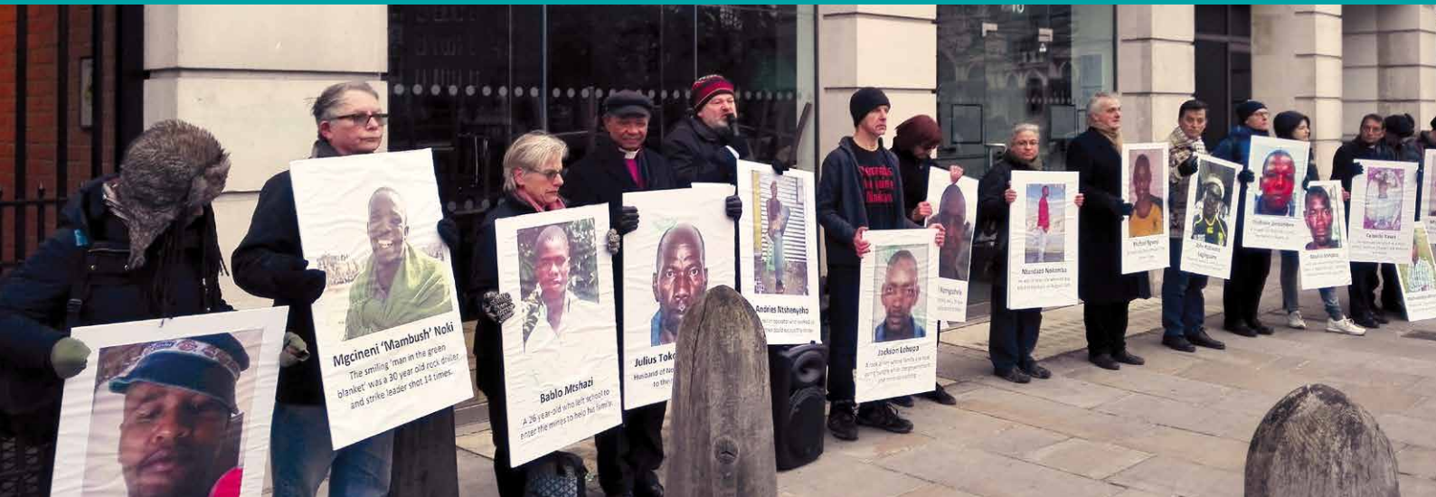
Solemn vigil before Lonmin AGM 2017: Ethical Shareholders Germany and activists from various non-governmental organizations show placards with the 34 killed Marikana miners.

Look for other events during Marikana Solidarity Week on: www.ethicalshareholders.org